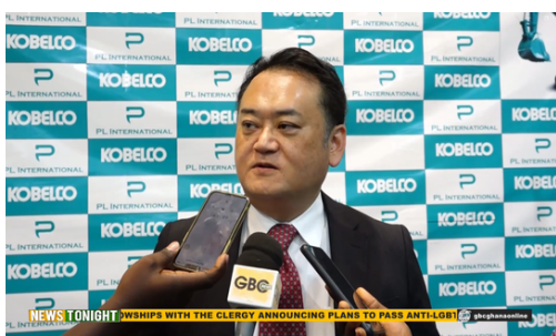
TV News Coverage- GBC NEWS

PL International is experienced in distributing construction machinery in Ghana, making them a suitable partner to introduce Kobelco's excavators. By combining their local market knowledge with Kobelco's advanced machinery, they can offer top-notch equipment to improve productivity and operational efficiency for Ghanaian companies.