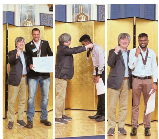
(KCMMEA Winners with the KCM President)