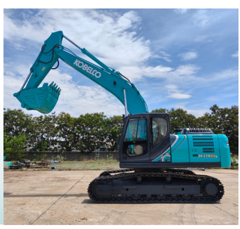
(Model: CKL2600I | Year of Manufacturing: 2016)