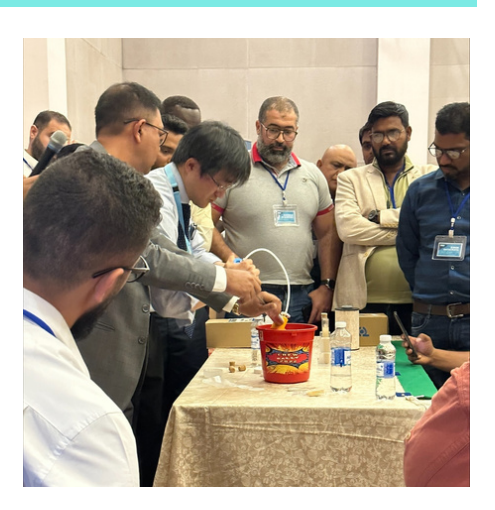
Actual filter demonstration to distinguish the difference between imitation and genuine filter.